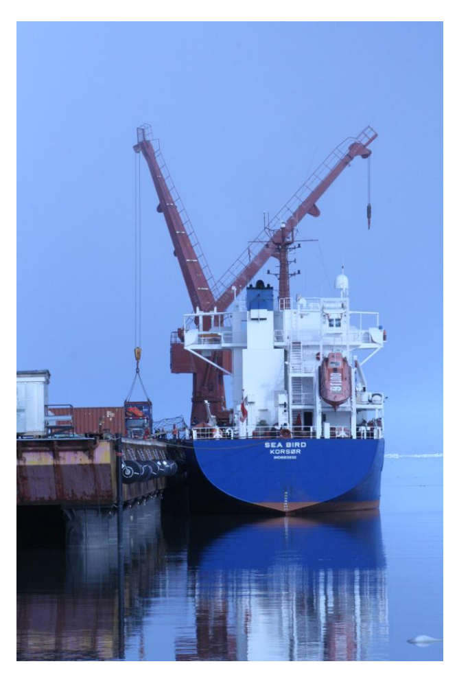
These Ocean Guard™ Netless foam filled fenders are designed to absorb 146 ft-kips (20 ton-m) of energy when 60 percent compressed with a corresponding load of 136 kips (62 tons).

The replacement fender system consists of the installation of 20 Ocean Guard™ Netless foam filled fenders measuring 4 ft diameter by 12 ft long each. These tough fenders are constructed with a heat laminated energy absorbing resilient foam core; a thick tough filament nylon tire cord reinforced non-marking urethane skin; and heavy- duty integral swivel end fittings internally connected with a stud-link chain. They are designed for superior performance in the world's harshest environments.